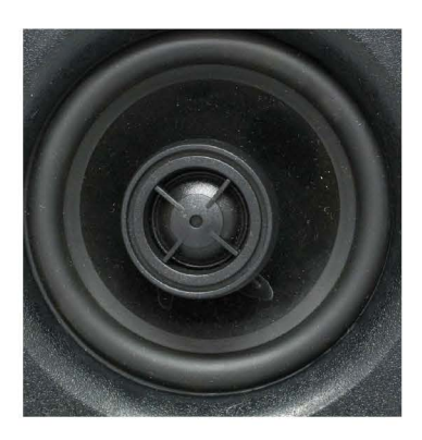
Swivel tweeter. (C PRO 4 and C PRO 6)