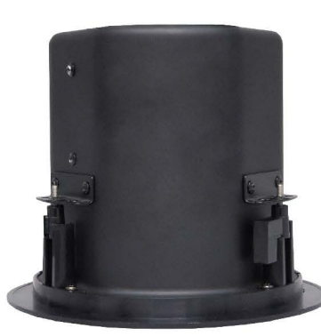
C PRO 4 and C PRO 6 enclosure