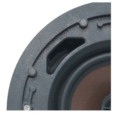
Grille fixation system based on magnet